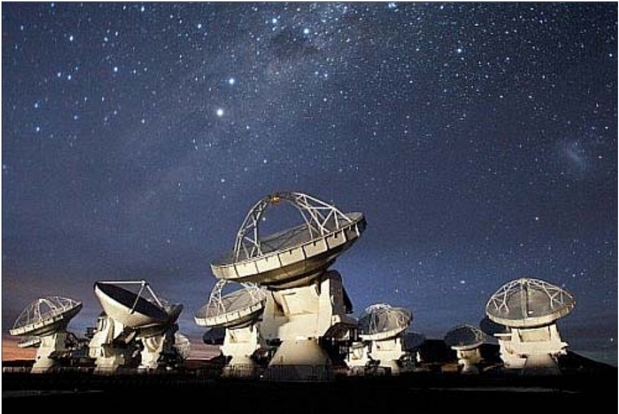
Figure 1621: Photo of the partially constructed ALMA observatory in 2011