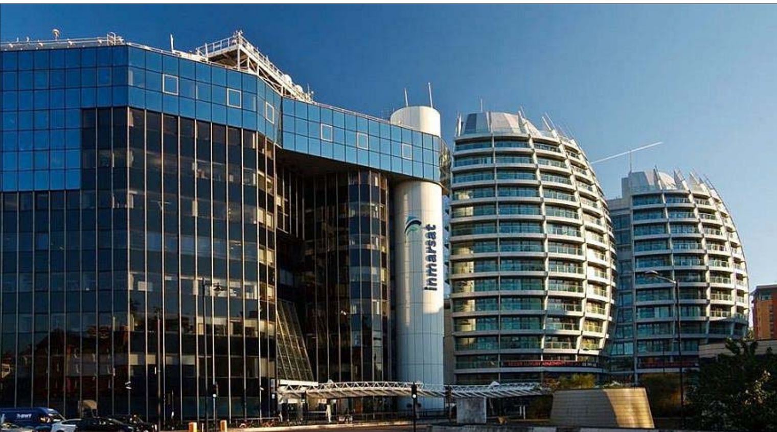
Figure 1623: Inmarsat’s London headquarters

Inmarsat . . . . . June 22, 2022: Viasat said June 21 that its shareholders voted to approve its $7.3 billion plan to acquire British satellite operator Inmarsat. 7220) The acquisition is subject to a long list of regulatory approvals on both sides of the Atlantic Ocean, including new national security procedures in the United Kingdom.