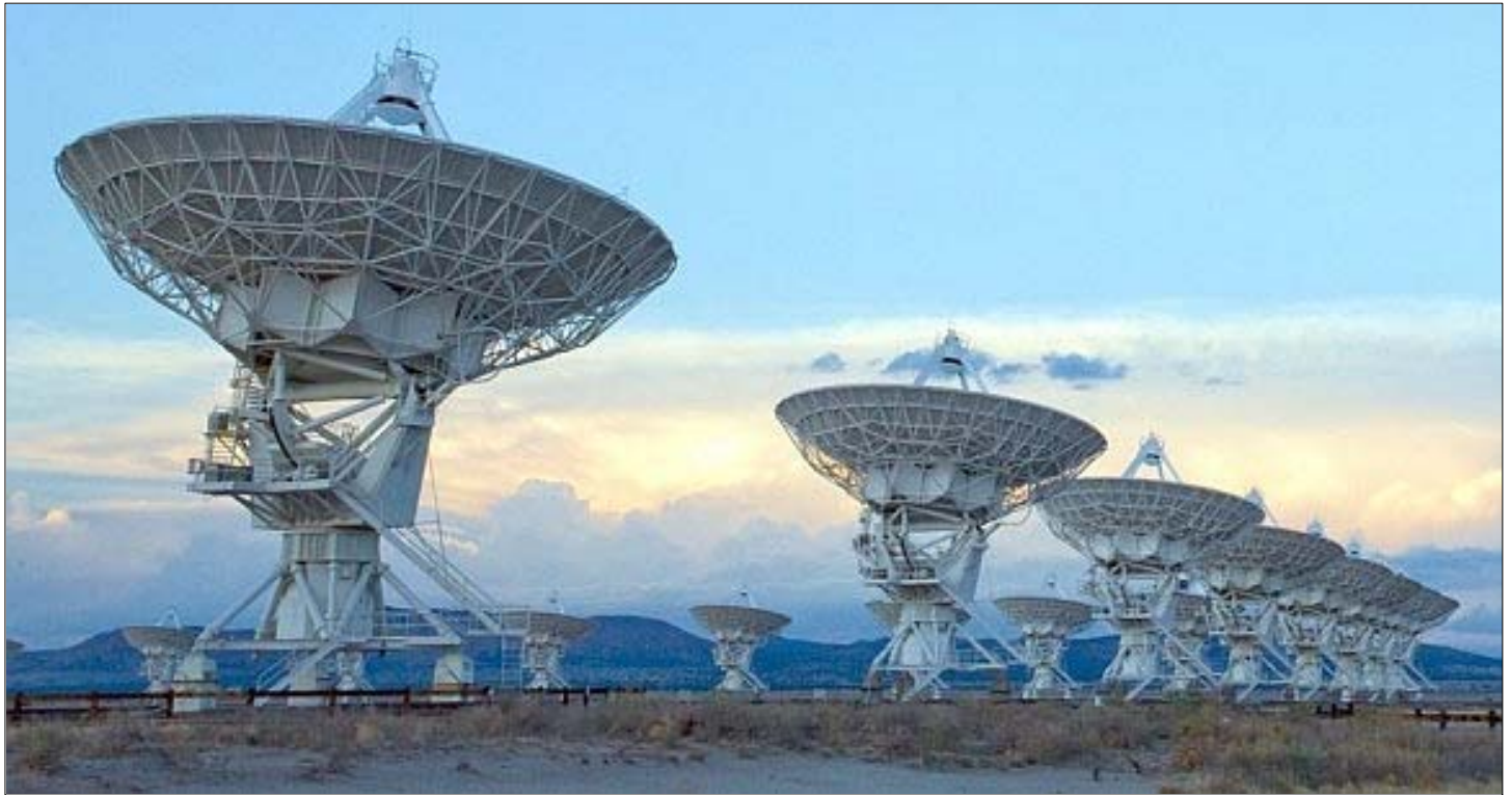
Figure 1626: Photo of the VLA system near Socorro, New Mexico