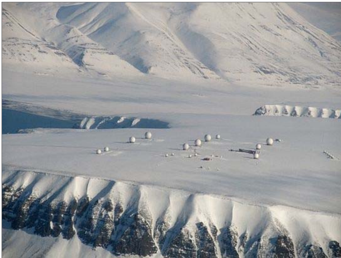
Figure 1624: KSAT ground station complex on Svalbard, SvalSat