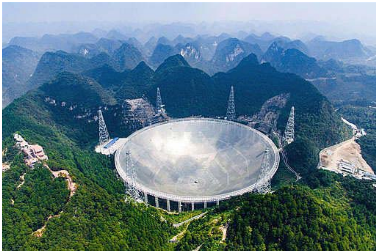
Figure 1622: An aerial photo of the FAST facility, released on Sept. 24, 2016, showing the FAST in Pingtang county in the southwestern province of Guizhou, China

Southern Observatory) to manage the huge amounts of data it generates. The software is called NGAS (Next Generation Archive System), and will help astronomers using the telescope to search for rotating neutron stars and look for signs of extra-terrestrial life. The NGAS data system will help to collect, transport and store about 3 PB (Petabytes, 3 \times 10^{15} ) of information a year from the telescope. 7184)